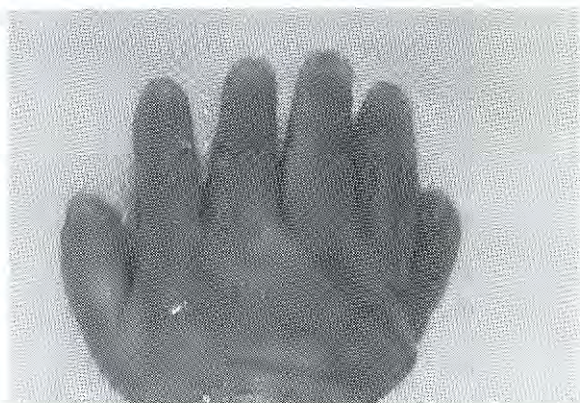
Fig. 3. Post mortem view of the dorsum of the right hand showing nail dysplasia and polydactyly.