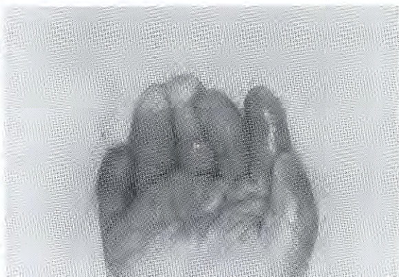
Fig. 2. Post mortem view of the right hand showing polydactyly.