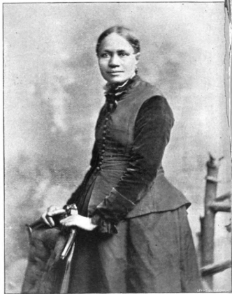
Frances C. W. Harper.