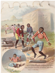
Seven Little Niggers chopping up sticks; One chopped himself in halves, and then there were six.